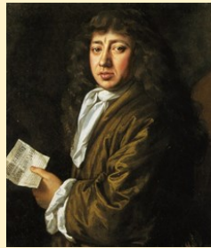
Samuel Pepys. Why is his diary so important?