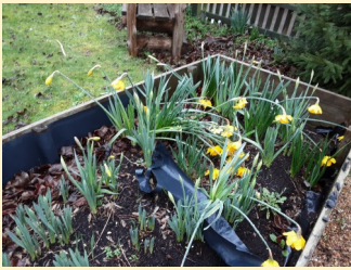
Visiting the 'Giant's Garden'.

We had lots of fun in Spring 1, learning about The Great Fire of London, learning about different materials and their properties and ending with us all creating an owl sketch! Some highlights: