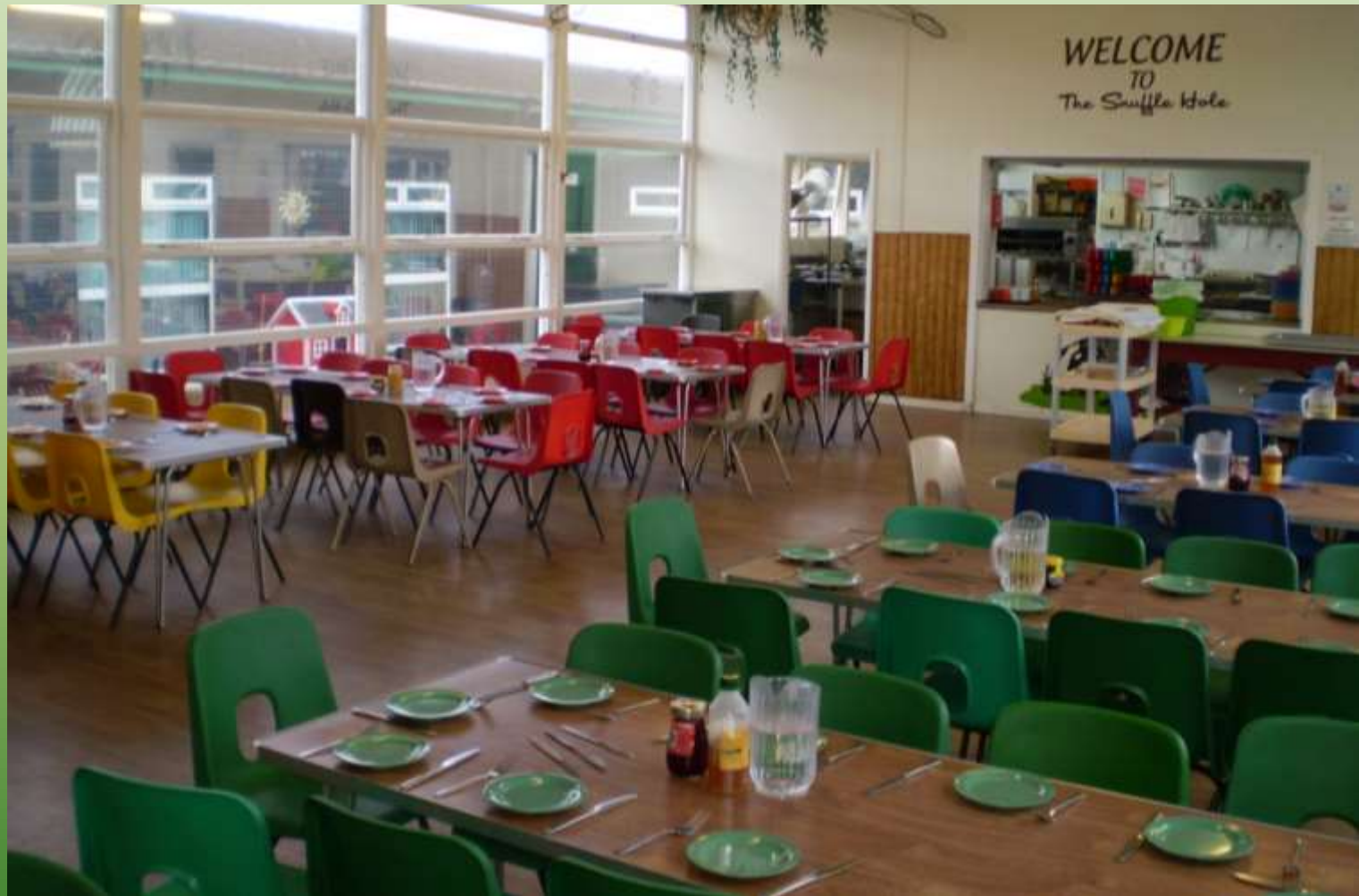
Inside the dining room